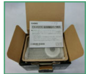
【 Comparison of Box Dimensions 】