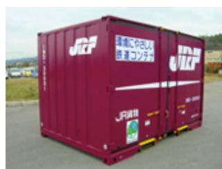
Environmentally friendly rail containers

CO 2 emissions for logistics (Environmental Data)