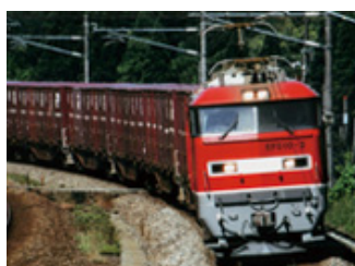
Promoting a modal shift to rail transport