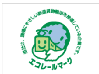
Eco Rail Mark

Casio now actively uses rail for transport from its logistics center in Saitama Prefecture to distribution centers in Hokkaido, Osaka and Fukuoka. Going forward, Casio will make active efforts to reduce environmental impact by pursuing environmentally friendly transport.