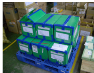
A reusable shipping carton employed for distribution in Asia

Starting in fiscal 2012, the reusable large shipping cartons are also being used to transport products.