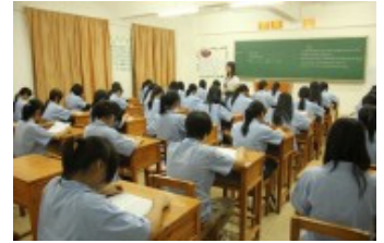
Skill level of trainees is rising every year

In June 2011, more than 20 graduates of the Casio Technology Course joined the company as employees. They are responsible for a variety of operations, including quality control and product assembly, and Casio has already identified some outstanding employees who are candidates for promotion to production line leader. Looking ahead, Casio hopes to further expand training of human resources utilizing the Casio Technology Course.