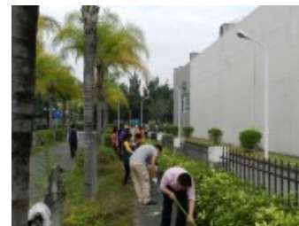
Casio Electronics (Shenzhen) Co., Ltd.,