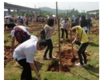
Tree planting events

Casio Electronics (Shenzhen) Co., Ltd., has been participating in tree planting events for eight years with the aim of mutual harmony and benefit between the global environment and the local community. In April 2012, 26 employees participated in the tree planting event, which was co-sponsored by the Shenzhen Urban Management Bureau and the Shenzhen Green Foundation. The event helped the company build even better relationships with community residents and heightened solidarity among employees.