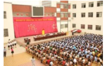
Casio Technology Course opening ceremony held at technical school in Hezhou, Guangxi province