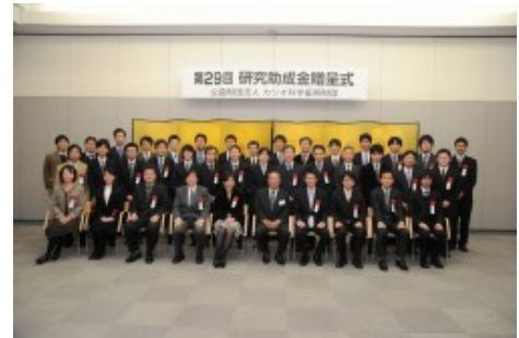
The 29th grant presentation ceremony (fiscal 2012)

Over the last 29 years, the Foundation has provided a total of about ¥1,381 billion in 1,091 grants.