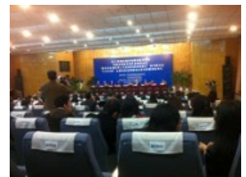
Contest Awards Ceremony

The contest is held to promote interchange between Chinese universities, stimulate research in the field of Japanese Studies in China, and help nurture outstanding scholars in the field of Japanese Studies. As a manufacturer of electronic dictionaries, Casio gives active support to these efforts, and the contest is held under the name of the "Casio Cup."