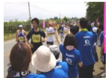
Yamagata Casio cheering squad

In order to forge even deeper relationships of cooperation and trust with local residents, the company will continue to actively promote this kind of community contribution activity.