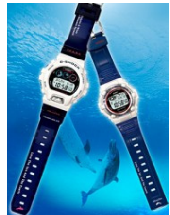
G-SHOCK and Baby-G watches help support the International Dolphin & Whale Eco-Research Network project

Founded in 1991, this non-profit organization undertakes activities to convey the wonder of dolphins, whales, and nature. Participants follow the three steps of learning, encountering, and caring, in order to help protect dolphins, whales and the natural environment.