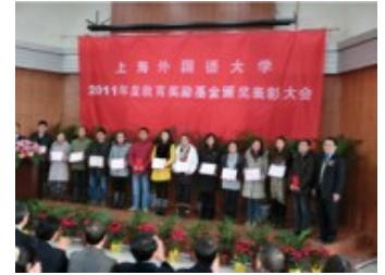
Fiscal 2012 Awards Ceremony (Shanghai International Studies University)

Looking to the future, Casio will provide support for scholarship across a diverse array of subject areas including languages, international finance and trade, international business administration, the mass media, law, and international education as it contributes to the development and revitalization of academic research.