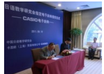
Ceremony for Certification as Designated Electronic Dictionaries

In 2011, in recognition of Casio's many years of consistent contribution to the teaching of Japanese in China, Casio's electronic dictionaries were awarded certification as "designated electronic dictionaries" by the China Japanese Education Association. This is the first such certification for a Japanese-language electronic dictionary by the Association, and the company's electronic dictionaries have thus become the sole certified brand.