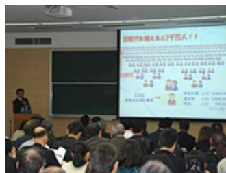
A Casio employee gives a presentation about the impact of the Casio school visit program at the 3rd National Meeting of UNESCO Associated Schools