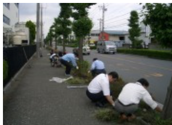
Casio Electronic Manufacturing Co., Ltd.