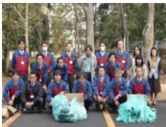
Casio Computer Co., Ltd. Hamura R&D Center

The Casio Group conducts regular community cleanups around company facilities through the volunteer efforts of employees at business sites and plants worldwide. The group will continue these cleanups in order to contribute to the local community.