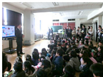
30 people including members of the Board of Education, educators and representatives from government organizations in Korea observe the school visit at Nagatadai Elementary School

Taking seriously the “education for sustainable development” (ESD) initiatives recommended by Japan’s Ministry of Education, Culture, Sports, Science and Technology, Casio will continue expanding these initiatives in collaboration with educational institutions in the future.