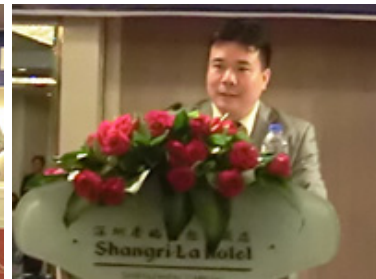
Presentation of exemplary CSR implementation and improvement by a supplier