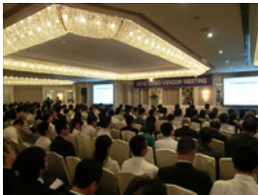
Briefing on Procurement Policies

Since fiscal 2011, Casio has been asking suppliers whose sites it had audited for CSR performance to present examples of their efforts to improve CSR activities. It is proving highly effective to share case studies and know-how when addressing CSR issues.