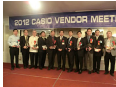
Award ceremony at the Procurement Policies briefing