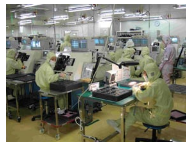
A production line in Southern China