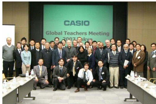
Global Teachers Meeting, Tokyo, 2007