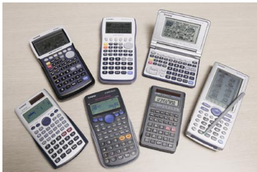
A range of scientific calculators for different applications