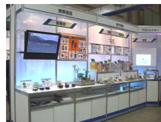
2. Cellular phone, electronic dictionary, and projector exhibit