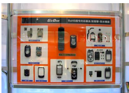
3. Disassembled cellular phone exhibit