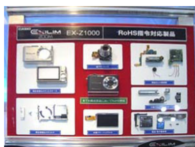
5. Disassembled digital camera exhibit