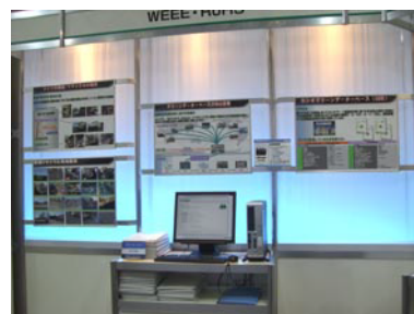
10. Response to WEEE and RoHS directives, and green database exhibit