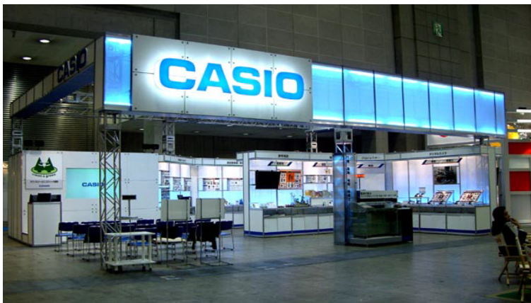
1. General view of booth area