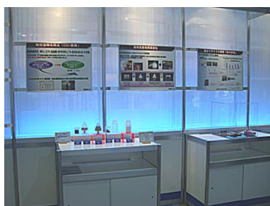
9. Japan sites environmental efforts exhibit (Kochi Casio, Casio Micronics)