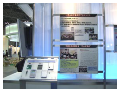
8. Factory Tours for 10,000 People exhibit (Kofu Casio)