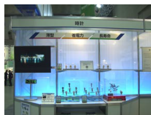
6. Watch exhibit