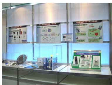
11. Energy-saving technologies: WLP and fuel cell exhibit