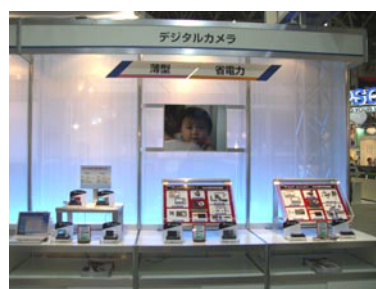
4. Digital camera exhibit