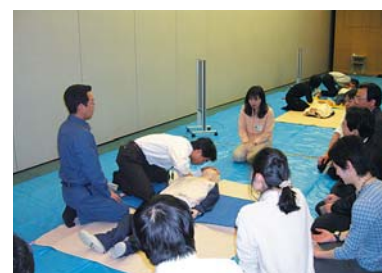
General lifesaving class

Casio is committed to the goal of zero occupational injuries and operates regular safety programs with the aim of maintaining an accident-free record at all Casio work sites. In addition, each site and group company conducts fire and disaster prevention/evacuation drills, as well as general lifesaving classes to ensure emergency preparedness.