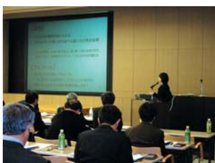
Health advice at a Senior Life Style Seminar

From September to November, 2006, Casio held a Walking Campaign to help maintain and enhance employee health as well as prevent lifestyle-related diseases. Casio made a point of encouraging employees and their family members to participate.