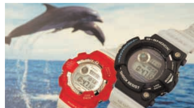
G-SHOCK A model of the "Dolphin & Whale Eco-Research Network"

In addition, Casio promotes the recognition of I.C.E.R.C. activities by displaying exhibits of the Cetacean in the antenna shop at Odaiba and at retail stores of Casio Distribution.