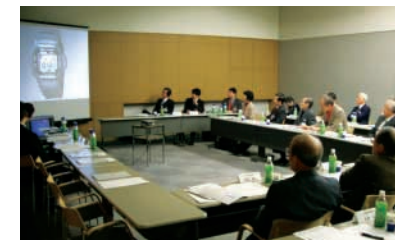
A Conference Corporations and People

Casio held one such conference on January 17 at its Head Office building as the company considered this conference to "provide a great opportunity to listen to the frank outside voice and communicate the company's activities to ordinary people." Casio welcomed twenty participants on the day. Following a brief explanation given by the General Affairs Department, a conference was held with the participation of the center personnel, who was the master of ceremony, and Casio personnel representing CSR Operations Section, Public Relations Department, and the Customer Support Center. Not only was Casio able to gain extensive information through questions and requests that came from people's perspective, but also had the participants develop deep understanding about Casio. The conference was thus mutually highly meaningful.