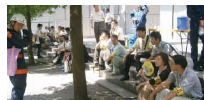
Participants resting in front of the Head Office building

On the Disaster Prevention Day, which falls on September 1 of every year, the Shibuya Ward government conducts a "Survival Walk Home Drill" as part of its disaster preparedness program in anticipation of people who will face difficulties going home in the event of a disaster. Since 2003, Casio has assisted with the drill like this by offering its head office building, which is on the course, to be used as an "aid station" for resting and information.