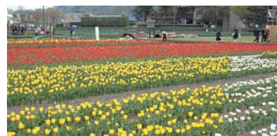
Field of Tulips, Foster Parented by Casio

In November 2004, Casio participated in the planting and planted 15,000 bulbs in approximately 990 m 2 of idle rice paddies, thus becoming a foster parent to tulips. Thanks to the care given by local volunteers, colorful tulips bloomed in the spring of 2005.