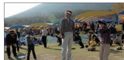
Local junior golfers receive lessons

Starting with fiscal 2005, which will mark the 25th anniversary of the golf tournament, the location of the tournament will change to the prefecture of Kochi, the birthplace of Casio's founder and where Casio has a major manufacturing subsidiary. The company will build closer ties with the local community with the relocation of the golf tournament.