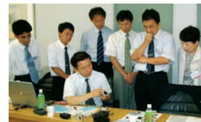
Training of Teachers

In fiscal 2004, which was the first year of participation for Casio, the company offered a 3 day-long program, from August 2 to 4, in which seven teachers from elementary and middle schools received training. The teachers who participated were surprised at the way Casio works with private corporation's goals and dreams and were very pleased with what they saw, saying that they would apply in their classrooms what they learned in Casio.