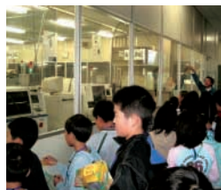
Factory Tour Scene

In fiscal 2004, students from five schools were invited, mainly to Kofu Casio Co., Ltd. Approximately 140 people, including the board of education chairmen from various municipalities, visited. In fiscal 2005, this program will be expanded with cooperation from production sites so that tours will be open to visitors from all over Japan.