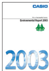
Environmental Report 2003

Casio began to publish its environmental report in 1999. The old reports, together with the latest report, can be viewed at Casio's Website.