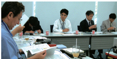
Sustainability Report Reading Session