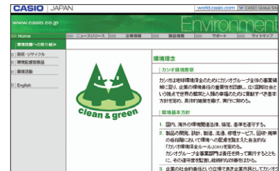
Environment Home Page

URL http://www.casio.co.jp/csr/ (in Japanese)