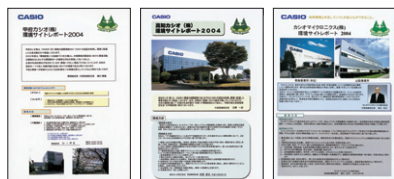
Site Reports 2004 (From left, Kofu Casio, Kochi Casio and Casio Micronics)

Again in fiscal 2004, Kofu Casio Co., Ltd. published its annual site report. In addition, Kochi Casio Co., Ltd. and Casio Micronics Co., Ltd. published their site reports for the first time. These reports provide details of their site-specific efforts on environmental conservation, resource saving, energy saving, and eco-communication.