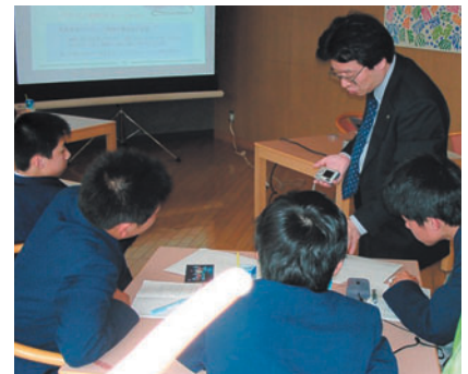
Explaining the development history of the digital camera