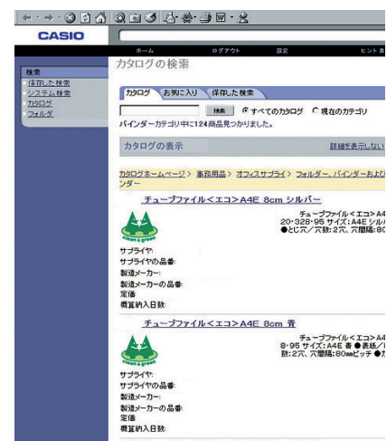
Screen of the CATS e-P system