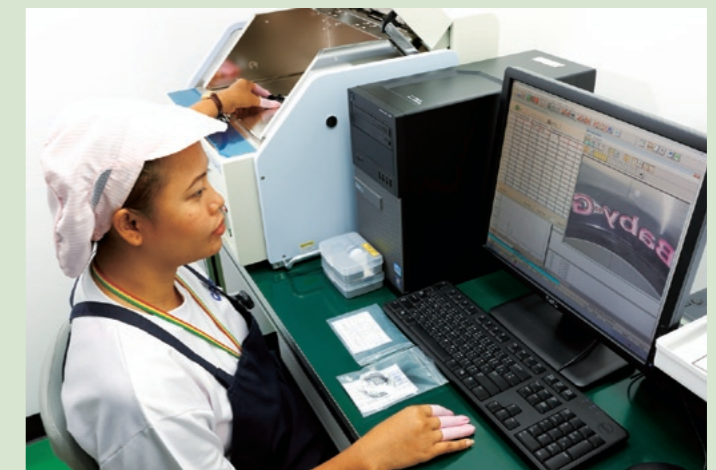
Thorough chemical substance evaluation at a plant

Countries worldwide have passed laws to regulate chemical substances contained in electrical and electronic products. The Casio Green Procurement Standards have been implemented based on the applicable laws in and outside Japan, including RoHS, REACH, and Japan's Chemical Substances Control Law. The company's materials purchasing departments ensure that its suppliers of parts and materials are in complete compliance with the standards, which reflect the latest laws and regulations. The development and engineering departments use a database to check whether all parts and materials that make up Casio products meet these same standards. Furthermore, the manufacturing plants also check whether the parts and materials used in mass production pass the criteria. Accordingly, Casio products only contain parts and materials that meet the company's own strict standards.