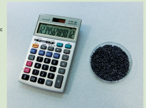
Product that complies with the Law on Promoting Green Purchasing, and recycled plastic material

Casio employs various recycled materials in its manufacturing. For example, it makes calculators that comply with Japan's Law on Promoting Green Purchasing, which requires public agencies to select and purchase products with minimal environmental impact. Casio uses externally procured 100%-recycled plastic for the body cases and battery compartment covers of its calculators. Some recycled plastic is also used to manufacture its cash registers, electronic musical instruments and other products. Casio values precious resources and promotes environmentally friendly manufacturing.