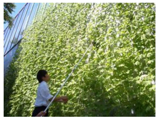
A green wall

The automatic blinds help to maintain optimal interior temperatures and lighting through automatic control of natural light. They block the intense summer sun. In addition, employees came up with the idea of saving more electricity by opening the blinds at lunchtime to let light in and turning off the lights.