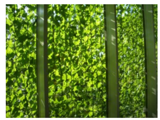
Reaches as high as the second-floor windows of the Hachioji General Affairs Section.

The center sports a green wall of bitter gourd plants. While it only covers part of the exterior, it shields the surface of the building and the interior from direct sunlight to prevent increases in temperature.