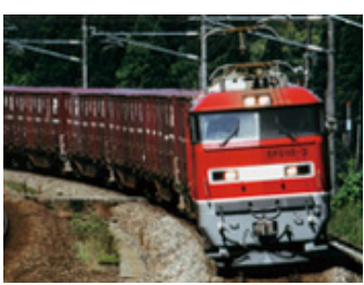
Promoting a modal shift to rail transport