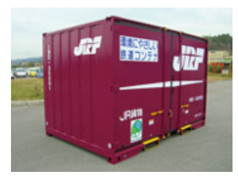
Environmentally friendly rail containers

CO2 emissions for logistics (Environmental Data)