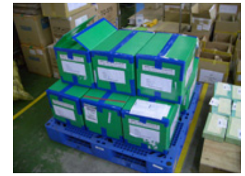
A reusable shipping carton employed for distribution in Asia

These cartons can be used to ship parts made in Japan to Hong Kong for use at Chinese production sites, and to ship timepiece parts from vendors in China, from Hong Kong to Thailand. By then transporting finished timepieces or timepiece parts from Thailand to Japan, the cartons never have to travel empty between the three countries.