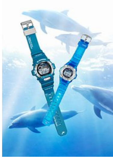
G-SHOCK and Baby-G watches help support the International Dolphin & Whale Eco-Research Network project

*1 International Cetacean Education Research Center (ICERC) of Japan Founded in 1991, this non-profit organization undertakes activities to convey the wonder of dolphins, whales, and nature. Participants follow the three steps of learning, encountering, and caring, in order to help protect dolphins, whales and the natural environment.