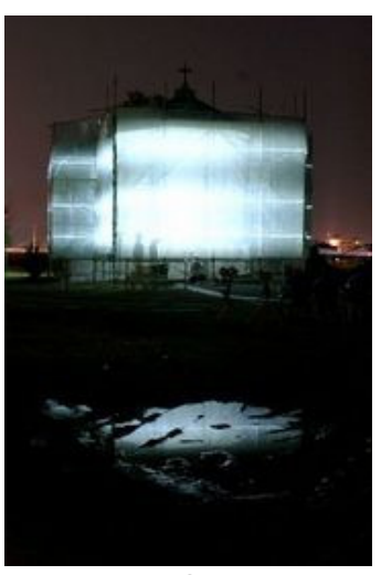
Light Projection Ceremony

Casio provided four projectors to the Ishinomaki Orthodox Church Rescue Project, sponsored by the Project of Route 45 (PR45). The aim is to help restore cultural heritage buildings in Ishinomaki, Miyagi, devastated by the Great East Japan Earthquake and Tsunami. Built in 1880, and located on the bank of the Kitakami River, which flows through the city, the Ishinomaki Saint John the Apostle Orthodox Church is Japan's oldest surviving wooden church, and is a designated cultural property of Ishinomaki. During a Light Projection Ceremony held from April 11 to May 11, 2012, the voices of a church choir were digitally converted into a light show projected onto the building.