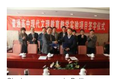
Signing ceremony in Beijing

Teaming Up with China's Teaching Materials Institute on an Experimental Education Program Casio (Shanghai) Co., Ltd. signed a three-year partnership agreement with the Teaching Materials Institute of China's Ministry of Education, for an experimental education program. The company will provide electronic dictionaries, graphing calculators, digital pianos, and projectors to 21 well-known foreign-language schools in China, and carry out an experimental teaching program. The educational effectiveness of these schools is expected to increase as a result.