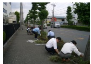
Casio Electronic Manufacturing Co., Ltd.