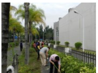
Casio Electronics (Shenzhen) Co., Ltd.,