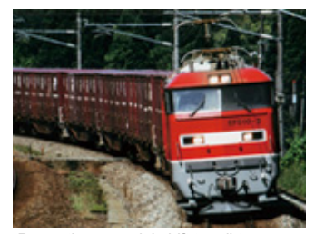
Promoting a modal shift to rail transport