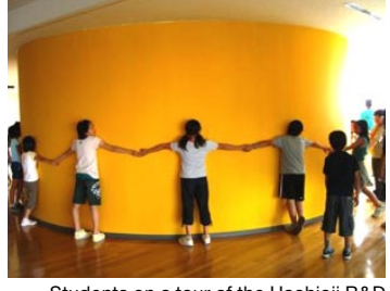
Students on a tour of the Hachioji R&D Center, learning about the high-efficiency heat storage tank

most environmentally advanced site within the Casio Group. Students can get a feel for