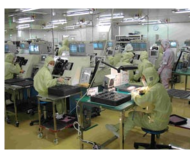
A production line in Southern China